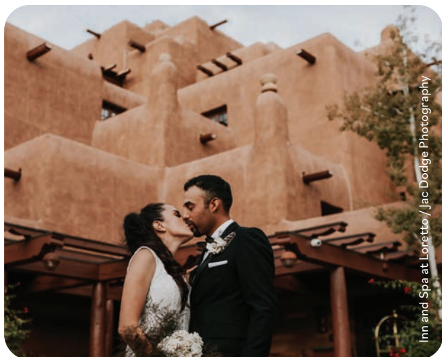
Inn and Spa at Loretto

All prices subject to 23% Service Charge and NM Sales Tax (Service Charge and NM Sales Tax subject to change)