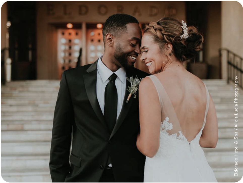
Eldorado Hotel & Spa