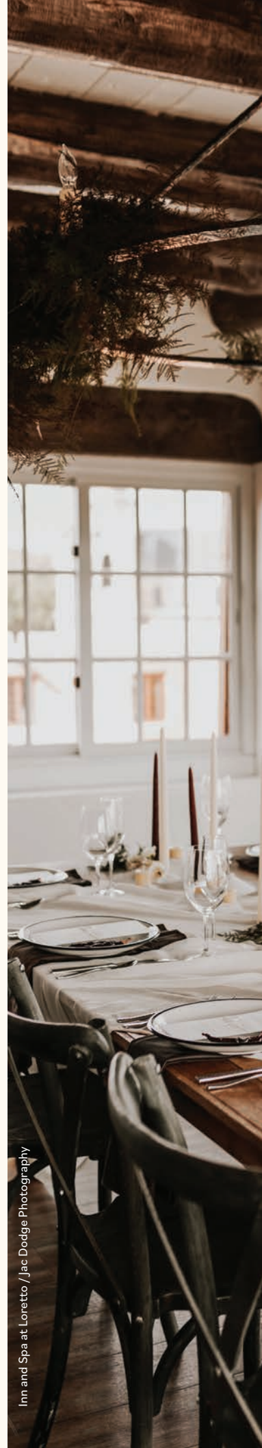
Inn and Spa at Loretto

“I experienced zero stress the day of my wedding.”