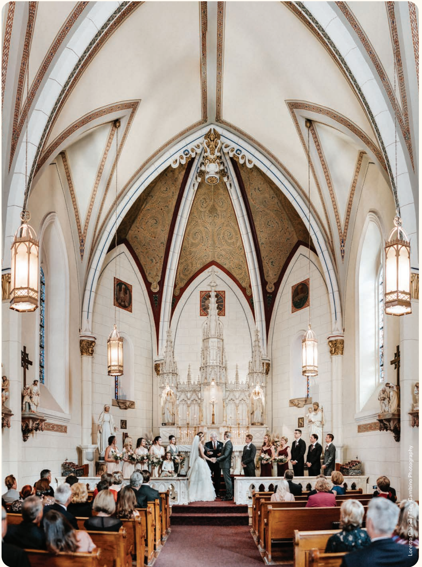
Loretto Chapel